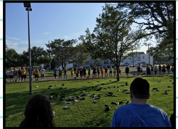
Game at Summer Camp 2019