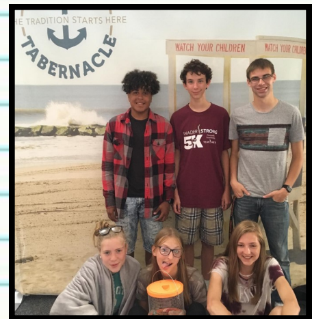
Small Group at Summer Camp 2019