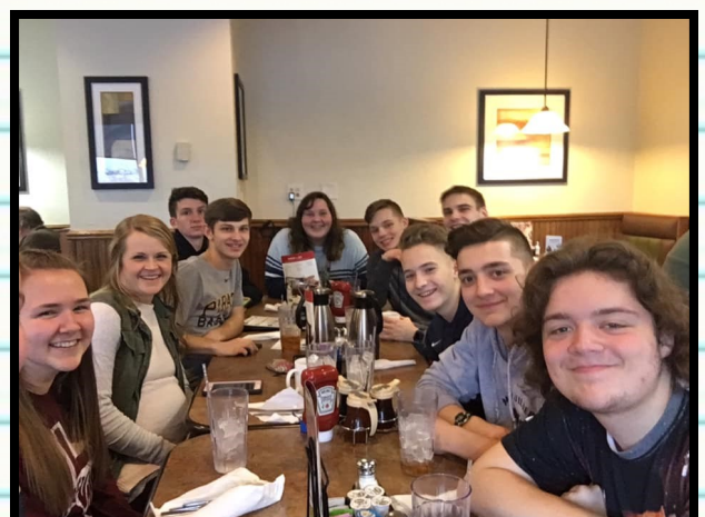
Group of Youth Eating Together